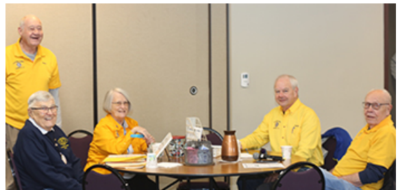
Pre meeting table conferences