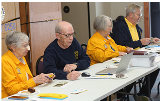
Ticket sale committee members record sold tickets