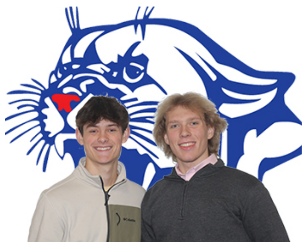
December 11 ~ Janesville Business Academy