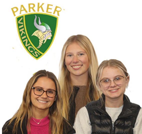
December 11 ~ Janesville Business Academy