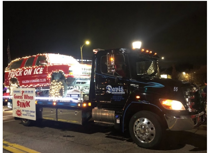
Davis Citgo provided the transportation for our float in the annual Janesville Christmas Parade