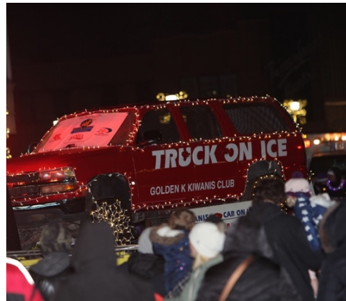
Truck On Ice – 2024 Christmas Parade