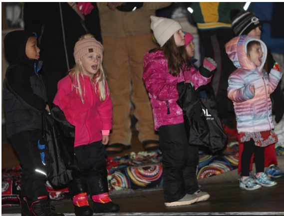
Children enjoying the Christmas Parade