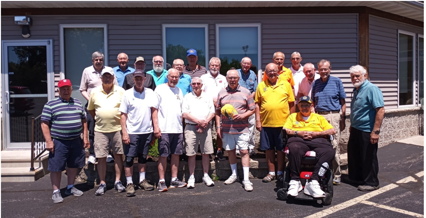
Bass Creek Golf Outing—June 23,2022—Lunch Group