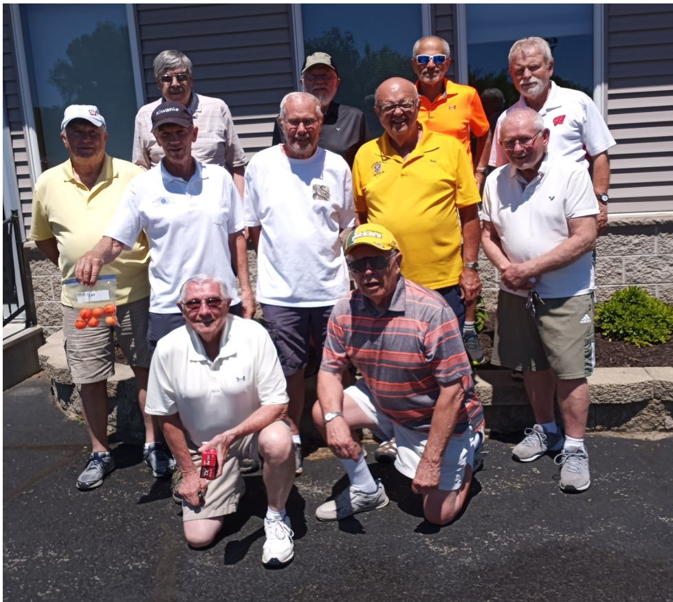
Bass Creek Golf Outing—June 23,2022--Players Group