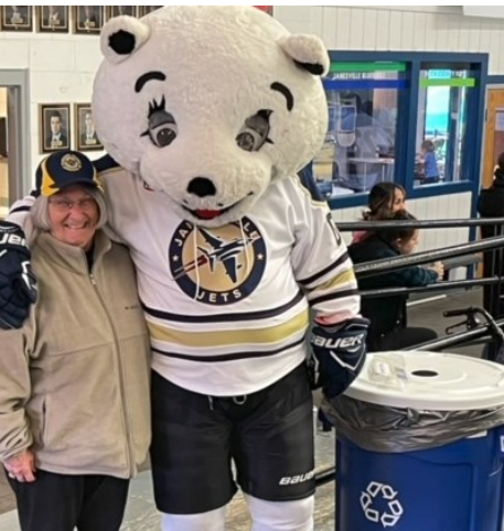
Nine members attended the Janesville Jets game