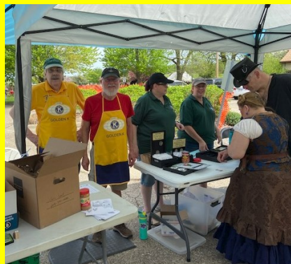
A good time at the Rennissance Fair

Non-golfers who wish to attend and enjoy the fun ans enjoy the lunch provided by the club should arrive by 11:00 AM.