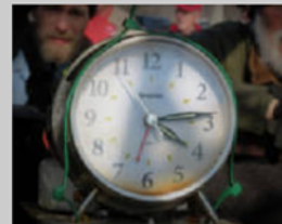
The Official Time 4:14 PM

Thank You Davis Citgo Without you, our project would not be possible