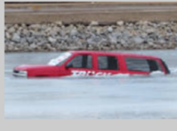
March 3 2022 The Suburban is down. We wait to safely retrieve the Suburban from the water, and establish the official sinking time.