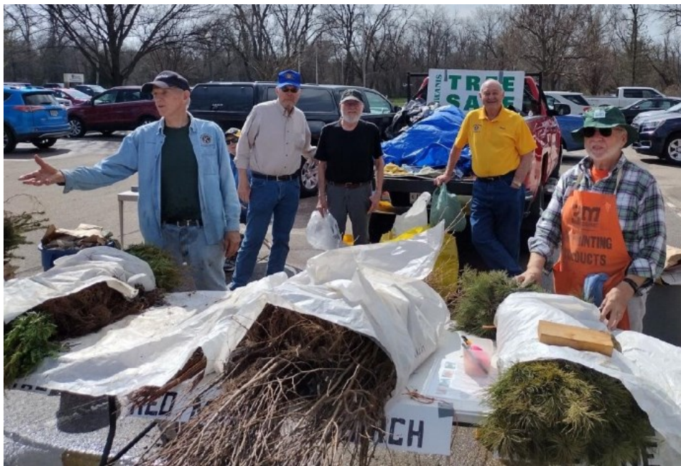
Tree sale at Rotary Gardens on April 23