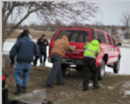
February 2, 2022 Suburban is launched at Traxler Park lagoon.