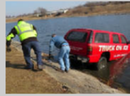
March 15, 2022 The ice is completely gone and the truck extracted from the pond.

Thank You Davis Citgo Without you, our project would not be possible