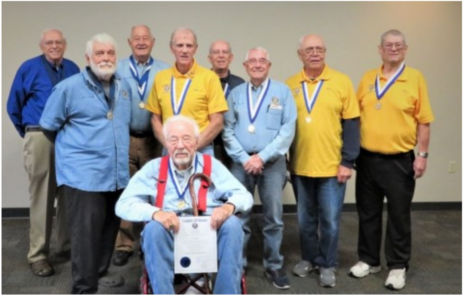
Club Hixson Zeller Awardees