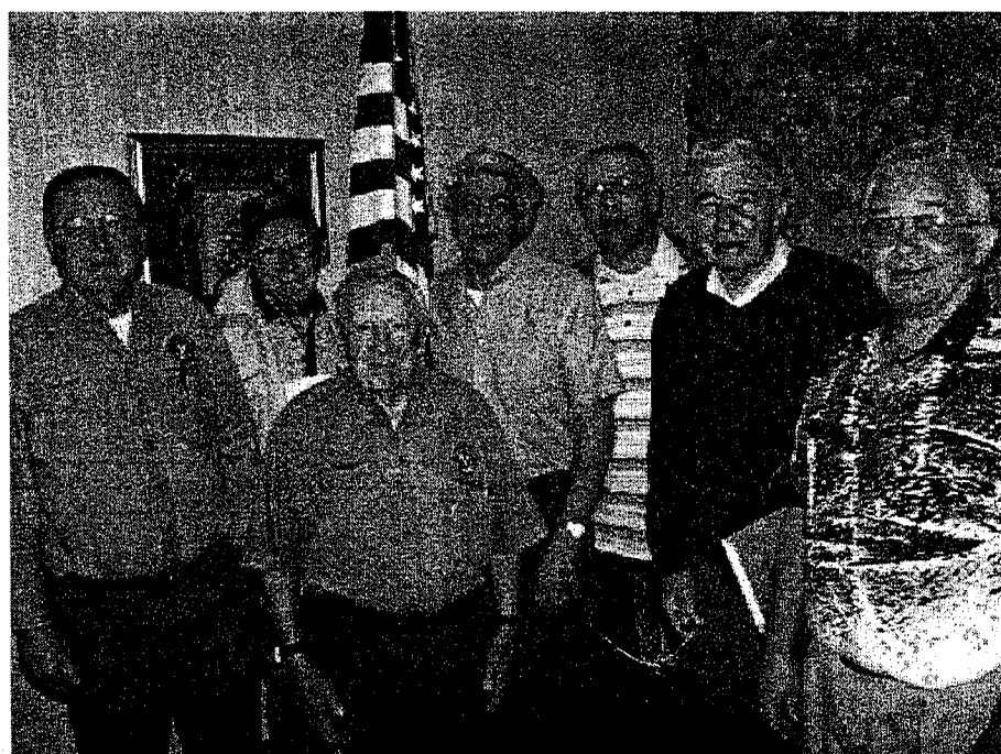
Seven Members of the Club visited the Whitewater Breakfast Club recently.